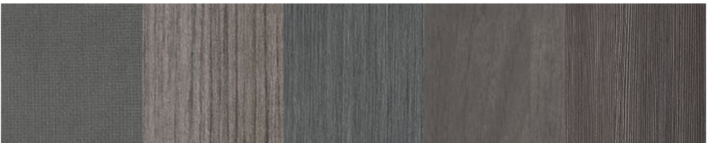
STEEL MESH 4879-38