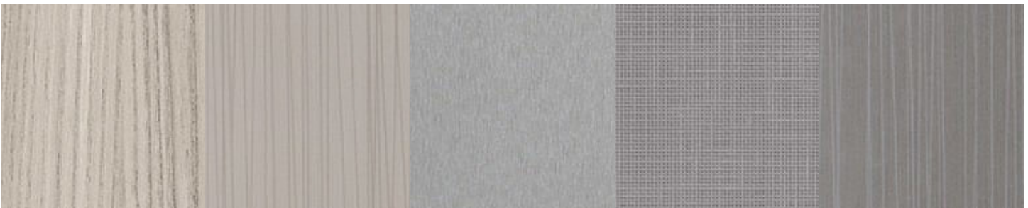
GREY ELM 8201K-12