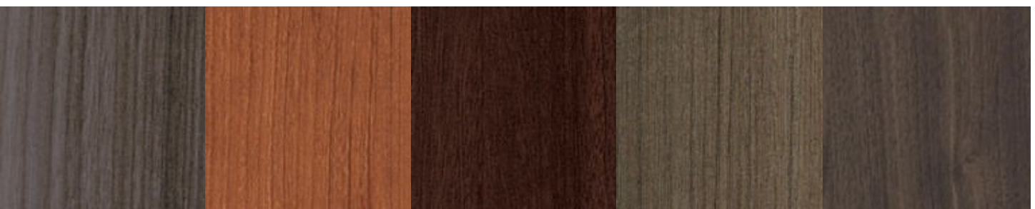
SKYLINE WALNUT 7964K-12