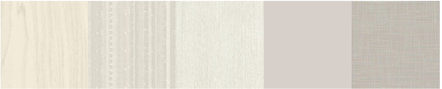
WHITE CYPRESS 7976K-12