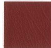
NEW BURGUNDY 518787