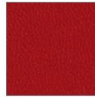
AMERICAN BEAUTY 520202