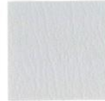
LITE GRAY 518781