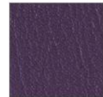
PURPLE IRIS 517919