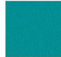
BLUE NILE 518762