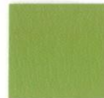
LEAP FROG 518780