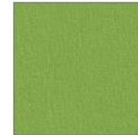
LEAP FROG 518780