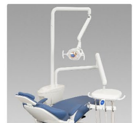
A5110 Chair mounted light - LED/Halogen