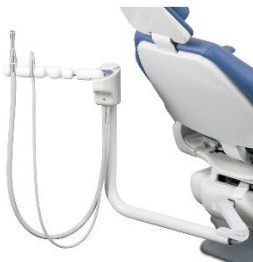
A6760 North Vacuum