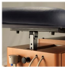
INCLINE ADJUSTMENT Manual