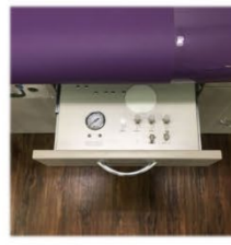
INTEGRATED DELIVERY (N7620) Concealed / Automatic