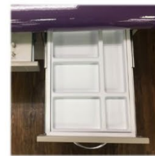
DRAWER INSERT 1 included