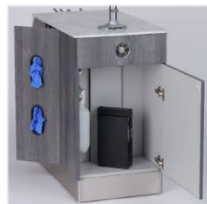
REAR CPU STORAGE