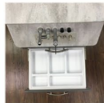
MATERIALS DRAWER 2 drawer organizers included