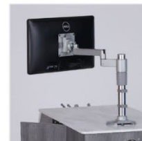
MONITOR MOUNT Monitor not included