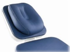
MAGNETIC HEADREST Easily positions the oral cavity