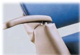
ARMRESTS Swing-out & removable