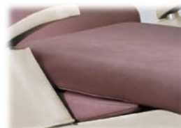
PEDO WEDGE Optional wedge creates flatter platform for children