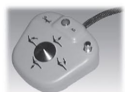
FOOT CONTROL Optional 5-way with Auto Return