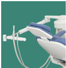
A6710 Assistant's Instruments w/ Telescoping Arm