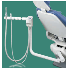
A6760 North Vacuum