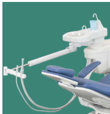
A6720 Assistant's Instruments w/ Telescoping Arm & Cuspidor