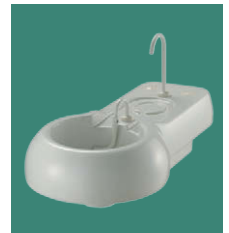
Porcelain Cuspidor Porcelain Cuspidor is available as upgrade