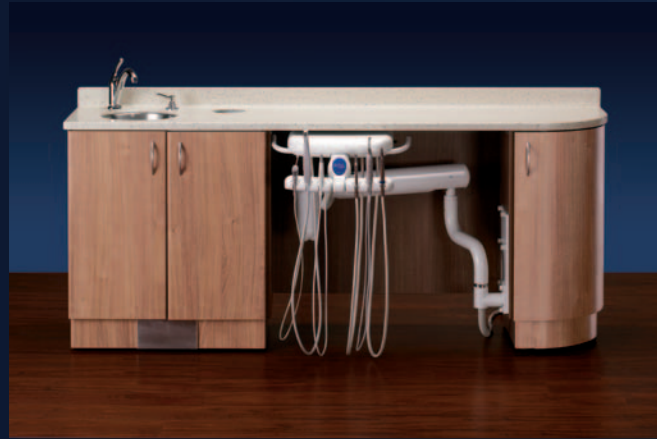
N7340 Doctor side delivery cabinet

Wall hung cabinets are available for towel, cup, and glove dispensers as well as for additional storage.