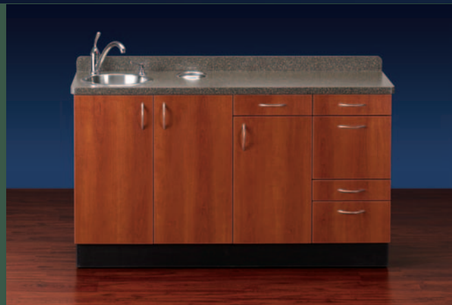
Contractor series side sink and support cabinet