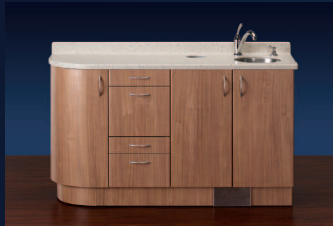
N7310 Assistant side support cabinet