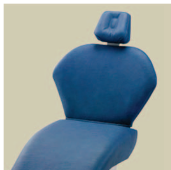
Optional Contour Backrest

Royal offers a full product line of Dental Chairs, Operator and Assistant stools, manufactured to the highest quality standards and available in a variety of price ranges.