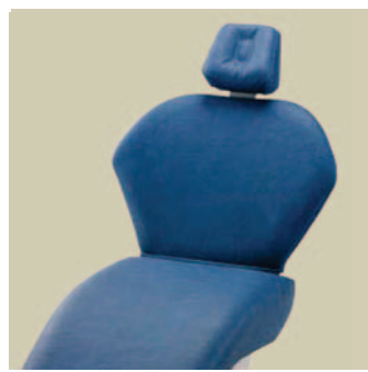
Optional Contour Backrest

Royal offers a full product line of Dental Chairs, Operator and Assistant stools manufactured to the highest quality standards and available in a variety of price ranges.