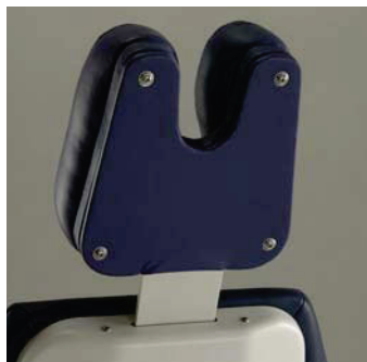
Optional upgrade: Ponytail Headrest