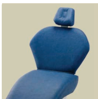
Optional Contour Backrest

Royal offers a full product line of Dental Chairs, Operator and Assistant stools manufactured to the highest quality standards and available in a variety of price ranges.