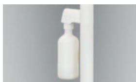
Patient water bottle has quick disconnect for ease of use