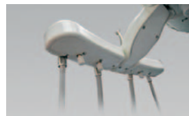
Precise coolant water adjustment at each handpiece