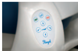
Mirror image touch pads on both arm rests

The Alliant Chair's base lowers to 13.5 inches from seat to floor. The Doctor's Unit is built to last, with a new diecast alloy chassis.