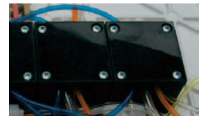
Alliant unit has Piston Valve control system with lifetime warranty