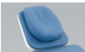
Magnetic headrest easily positions the oral cavity