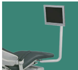
Compass mount Flat Screen Monitor Mount * Monitor not included