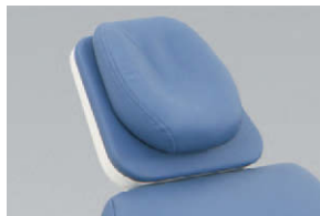
Magnetic headrest to easily position the oral cavity - other headrests available (see catalog)

Royal offers a full product line of Dental Chairs, Operator and Assistant stools manufactured to the highest quality standards and available in a variety of price ranges.