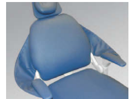
Slim back with slings available as option