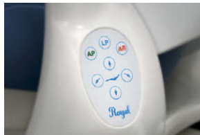
Mirror image touch pads on both arm rests